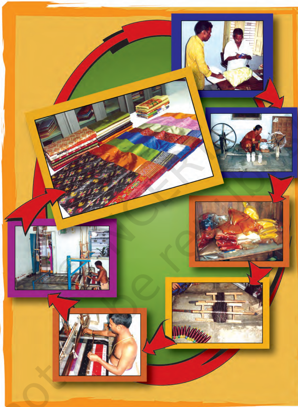
Process of making pochampalli sarees